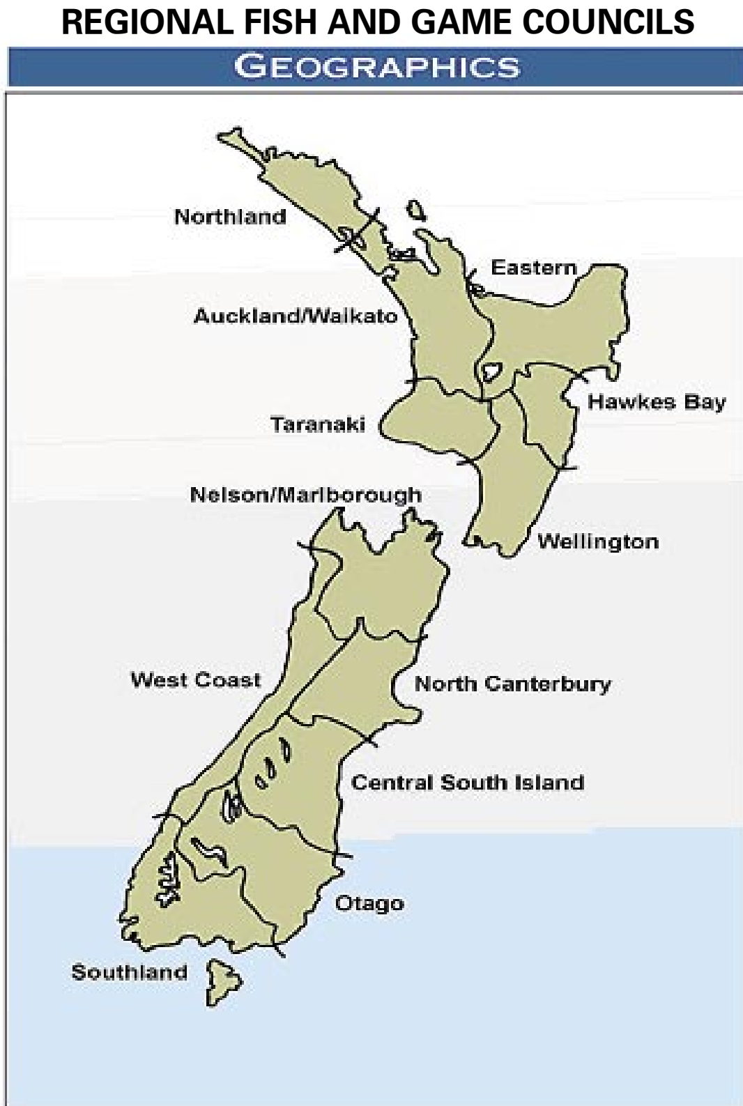
Figure 1: Regional Boundaries

The Hawke's Bay Region is responsible for managing the freshwater sports fisheries and game bird populations within this area. The region includes the urban areas of Napier, Hastings, Waipawa and Waipukurau.